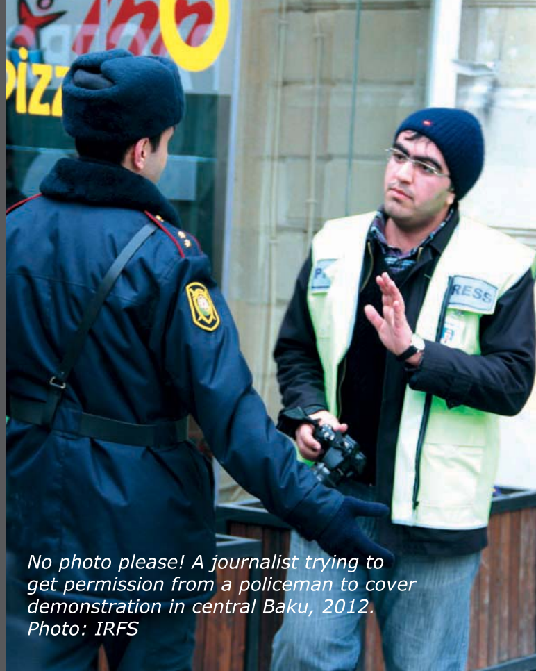
No photo please! A journalist trying to get permission from a policeman to cover demonstration in central Baku, 2012.

To that end, the Institute for Reporters' Freedom and Safety (IRFS) has developed a set of recommendations outlining steps needed to protect the rights to freedom of expression, assembly and association.