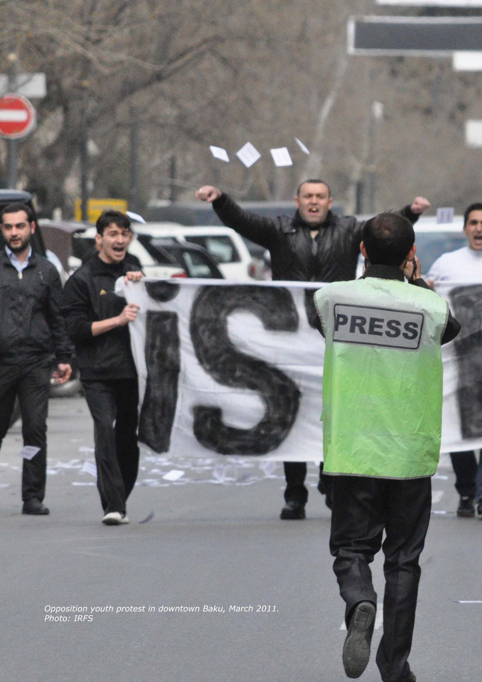
Opposition youth protest in downtown Baku, March 2011.