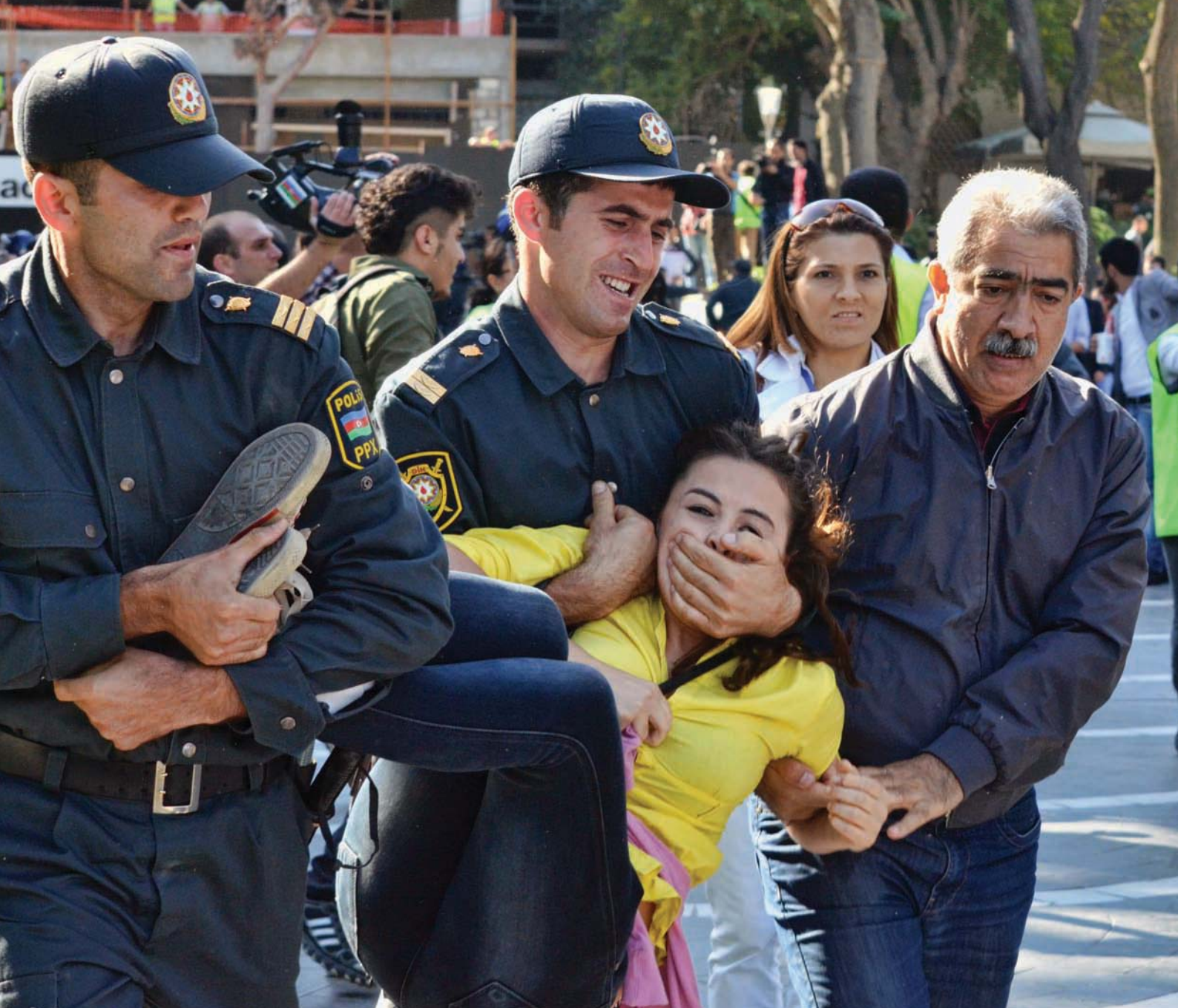
Police crackdown on peaceful demonstration in Baku, October 20 2012.