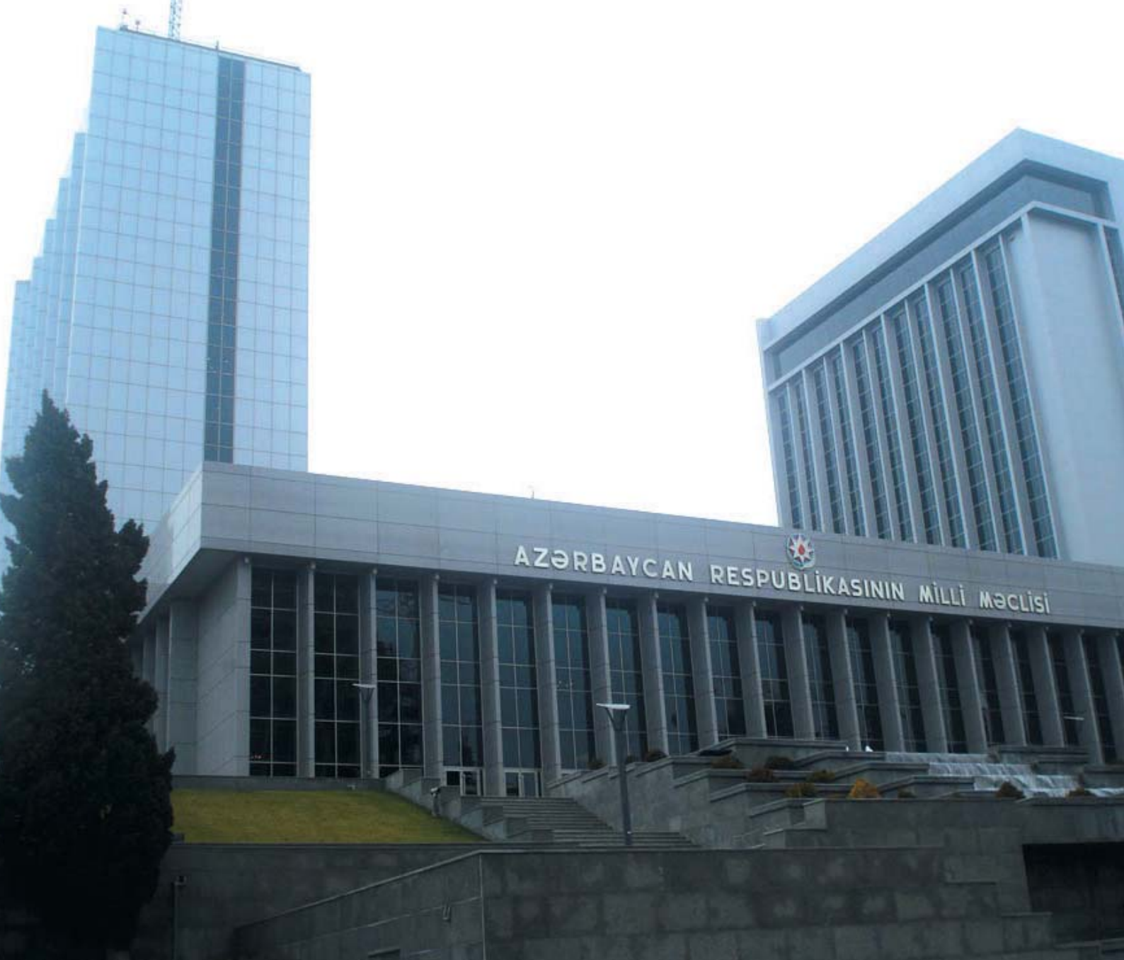
The house of Azerbaijani Parliament, Milli Majlis.