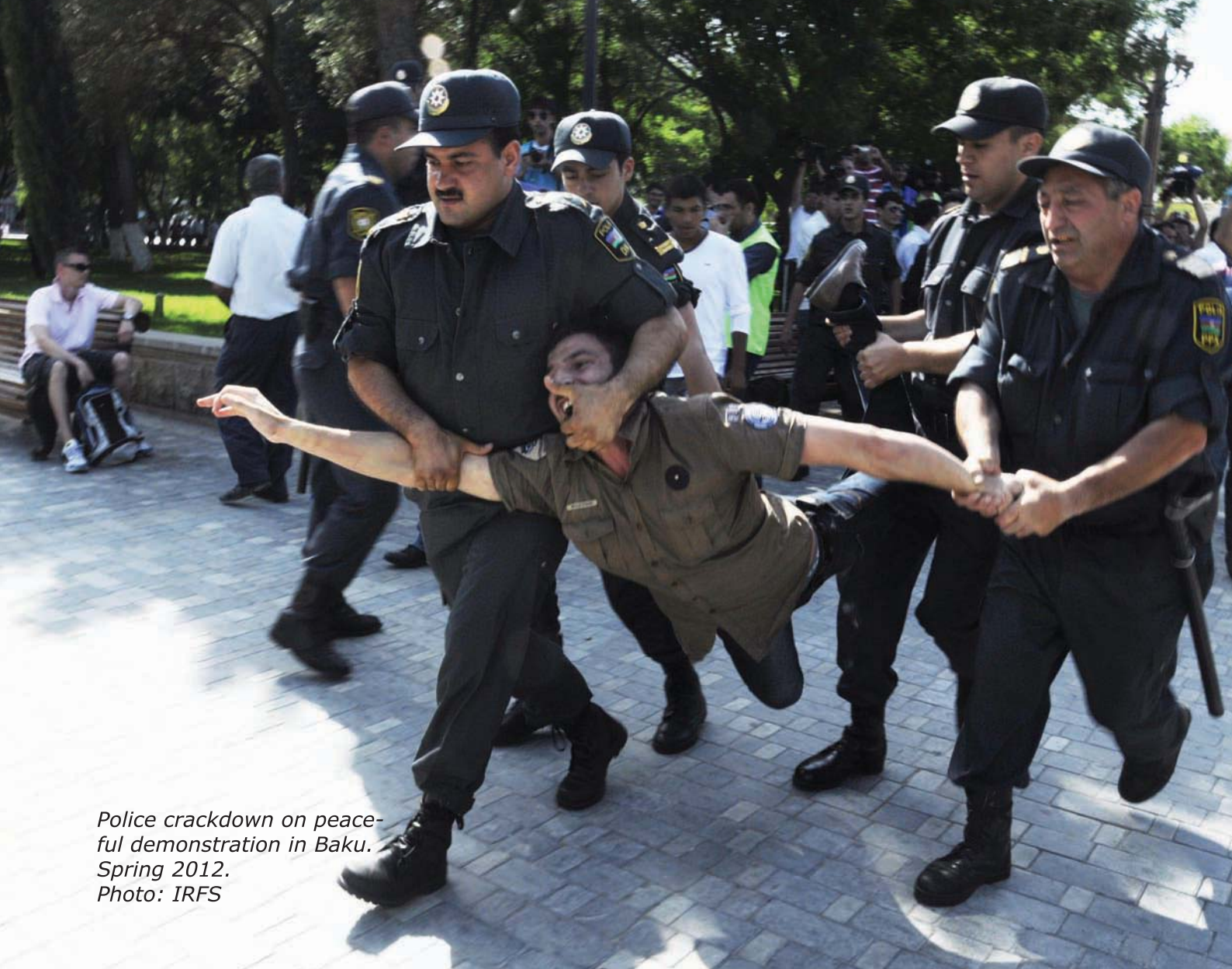
Police crackdown on peaceful demonstration in Baku. Spring 2012.

not dare appear in society” and that “public hatred” should be shown to them. In July 2012, the president made further ominous comments, stating that those who had exposed human rights problems in Azerbaijan ahead of Eurovision were “anti-nationalist forces” and “traitors to the nation.” 4 Given the high level and public nature of these comments, local activists fear retaliation once international attention – which peaked during Eurovision but was somewhat sustained in the period ahead of the IGF – has shifted from the country.