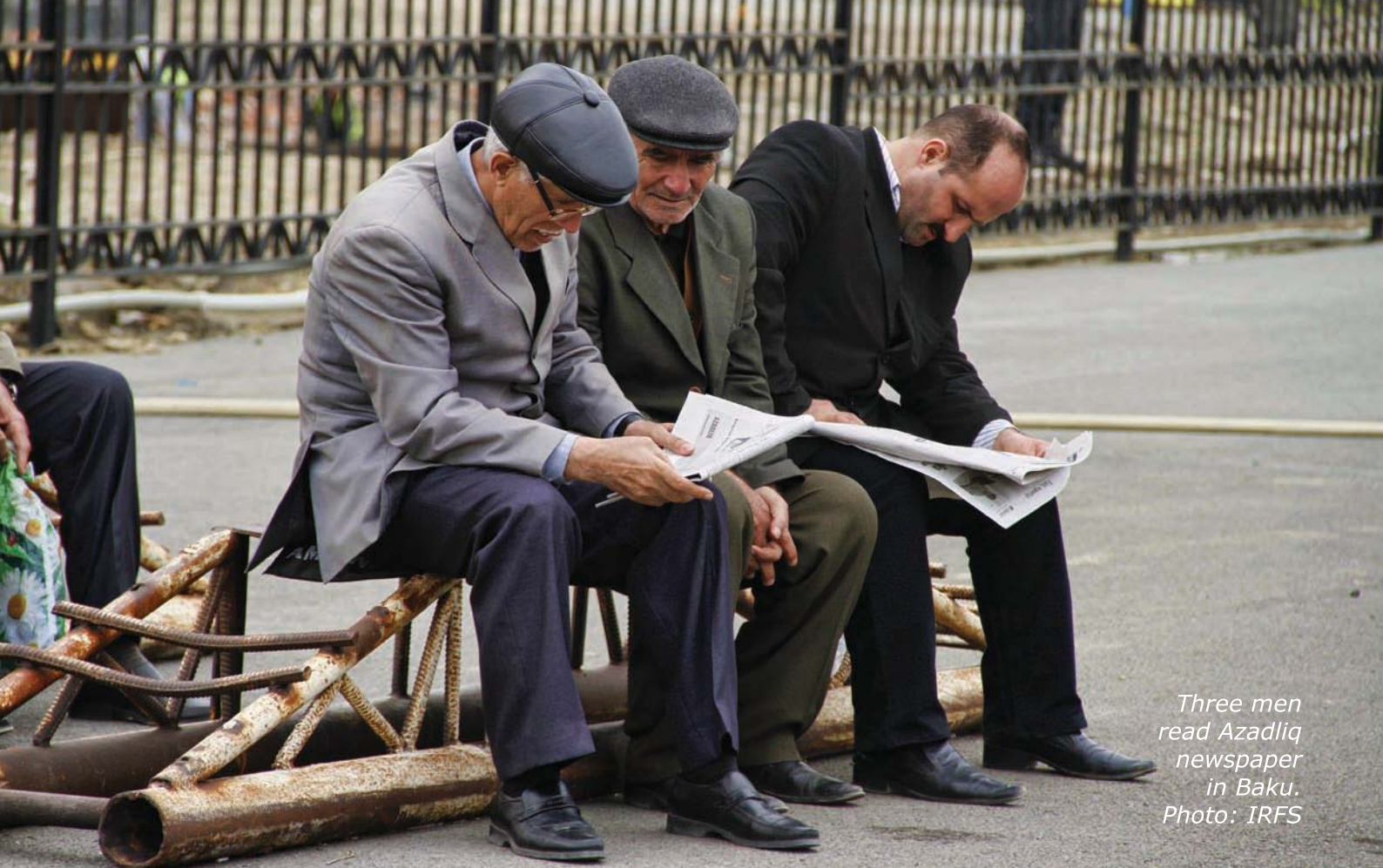
Three men read Azadliq newspaper in Baku.

public associations. It often disseminates incorrect information about individuals and organizations, and refuses to grant them airtime to exercise their right to reply.