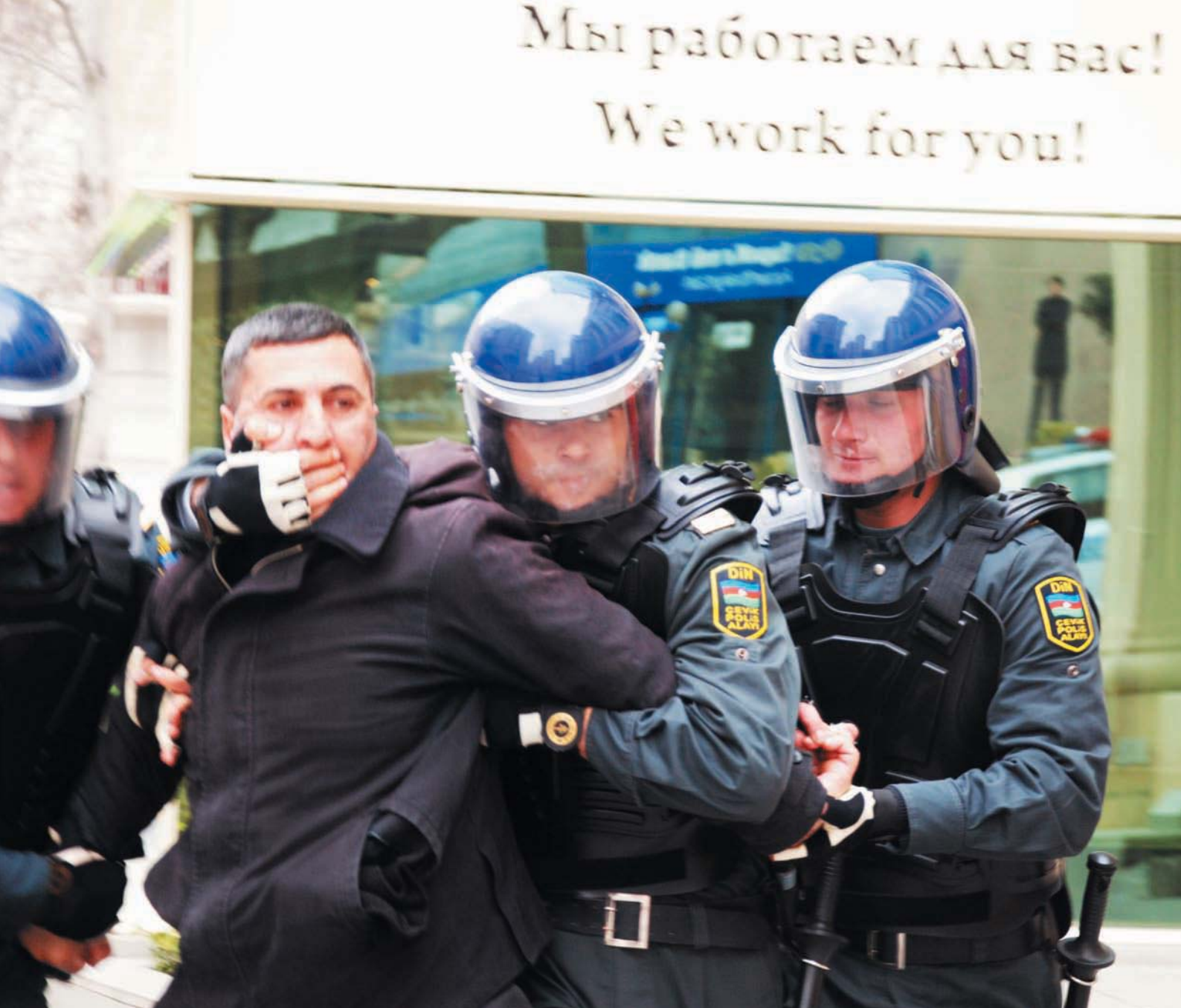
Azerbaijani riot police detain a man during a protest march. Spring 2011, Baku.