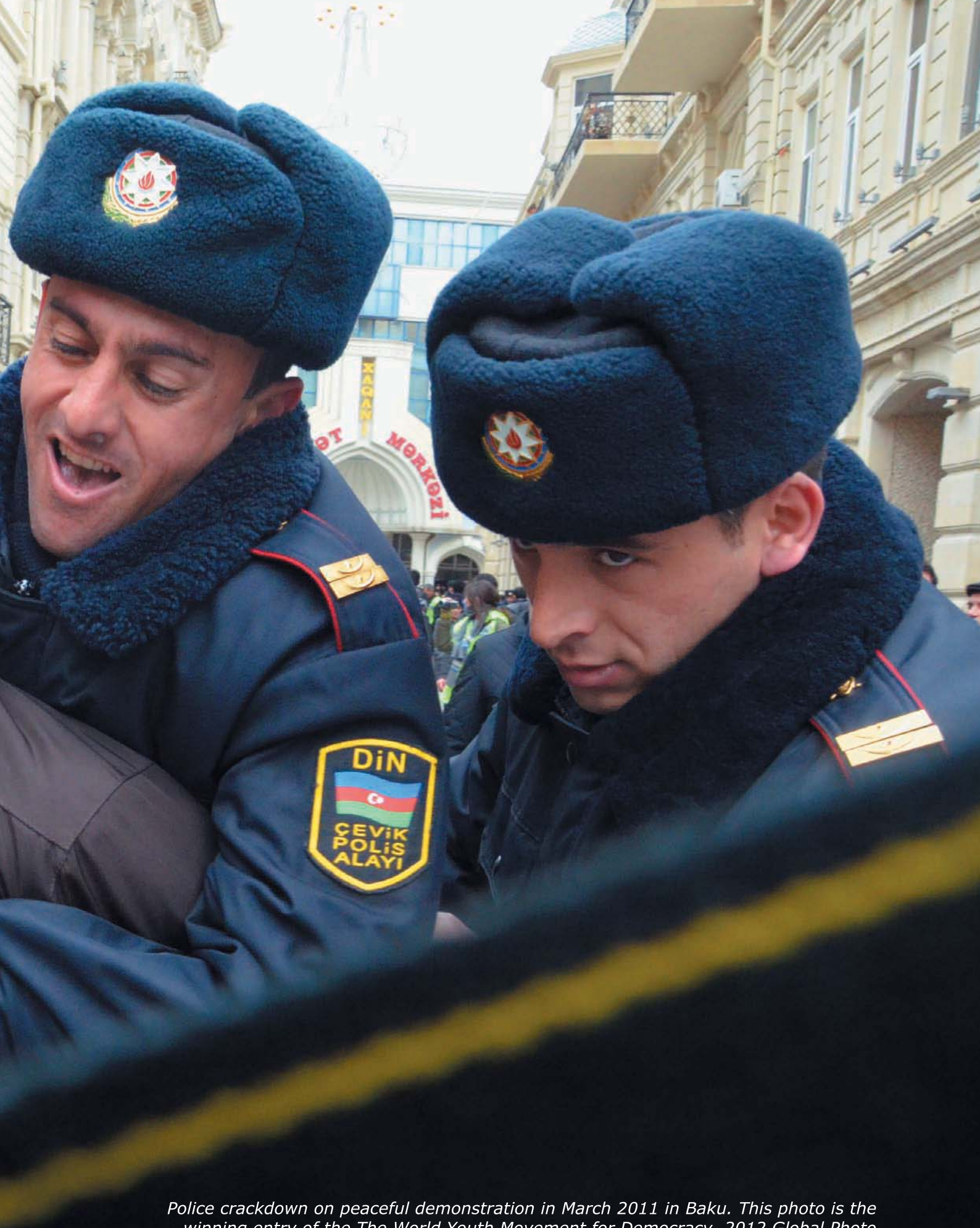
Police crackdown on peaceful demonstration in March 2011 in Baku. This photo is the winning entry of the The World Youth Movement for Democracy, 2012 Global Photo Contest "Youth in Action: A Snapshot of Democracy".