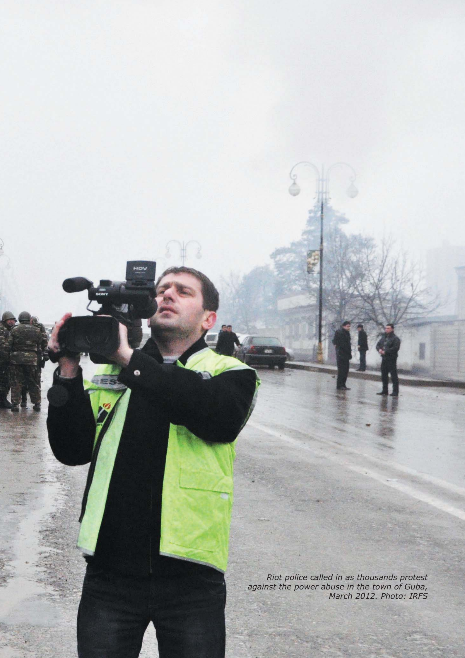
Riot police called in as thousands protest against the power abuse in the town of Guba, March 2012.